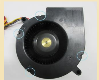
Outlet Drain Holes