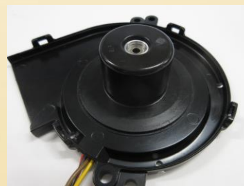
Epoxy resin coating of motor (IP68)