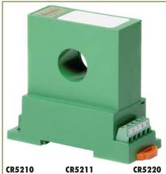
CR5210 CR5211 CR5220 Single Element - .79" Window 0.1 to 600 ADC Input Range