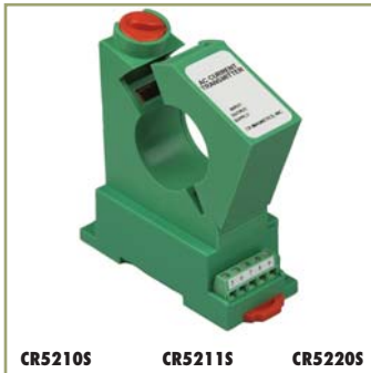
Single Element - 1.2" Window 20 to 600 ADC Input Range

The CR5200 Series, DC Current Transducers are designed to provide a DC signal which is proportional to a DC sensed current. These devices are designed for direct current only, targeting them towards general and daily applications. The ranges 2 to 20 Amp Solid Core Versions, utilize an advanced Magnetic Modulator technology. The ranges 20 amps Split Core and > 20ADC Solid Core, utilize Hall Effect technology.