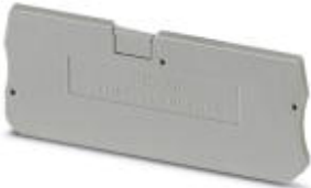
The figure shows a version of the article

End cover, Length: 78.5 mm, Width: 2.2 mm, Color: gray