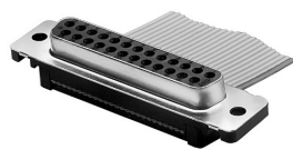
Receptacle- Low Profile Metal Shell