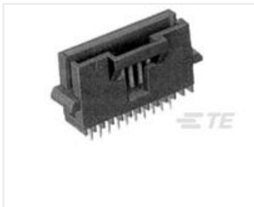
TE Part #5-104071-2 05 SYSTEM 50 HDR SRST SHRD SN