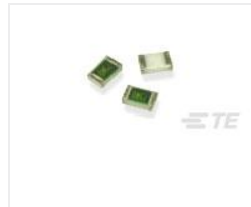
TE Part #1676666-3 RN 0805 20R 0.1% 10PPM 5K RL