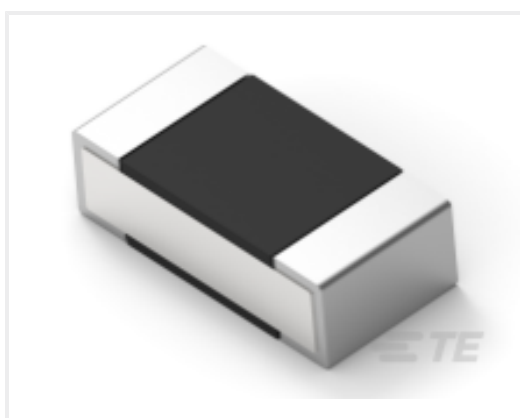
TE Part #8-2176305-7 RP 1E 0.1W 845R 0.1% 25PPM 5K RL