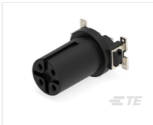
TE Part #224064-E M12 FEMALE, A CODE, 5P, 17MM SMT