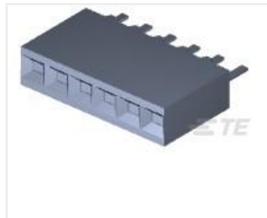
TE Part #5-534237-4 06 MODII VRT SR CE 100/115