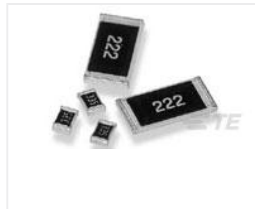
TE Part #9-1676480-7 CRG0402 1% 9K1