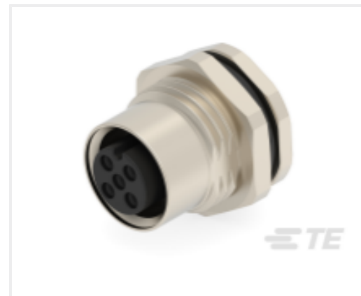
TE Part #T4131012021-000 M12,REAR MOUNT,FEMALE,A,2P, SOLDER WIRE