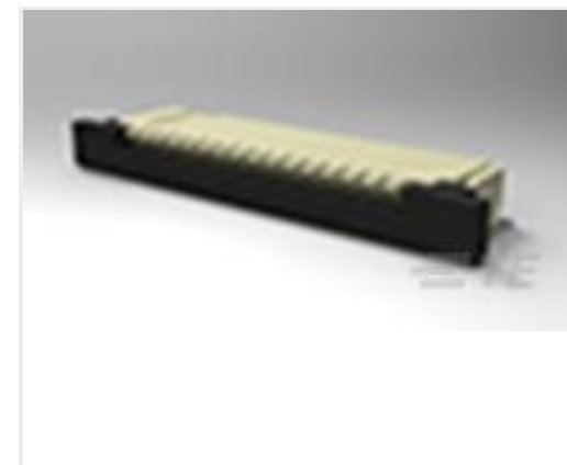
TE Part #1-84953-2 1MM FPC HORZ.TOP CONT.ASSY 12P