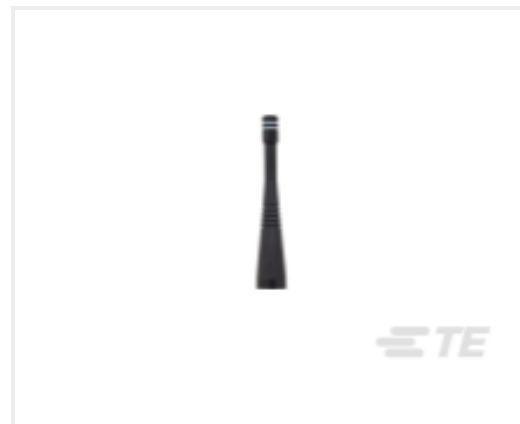
TE Part #ANT-868-CW-QW Antenna 1/4 Wave Whip 868MHz