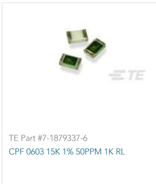
TE Part #7-1879337-6 CPF 0603 15K 1% 50PPM 1K RL