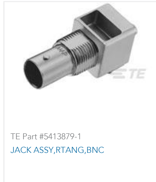
TE Part #5413879-1 JACK ASSY,RTANG,BNC