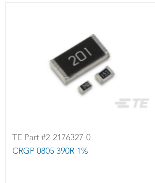
TE Part #2-2176327-0 CRGP 0805 390R 1%