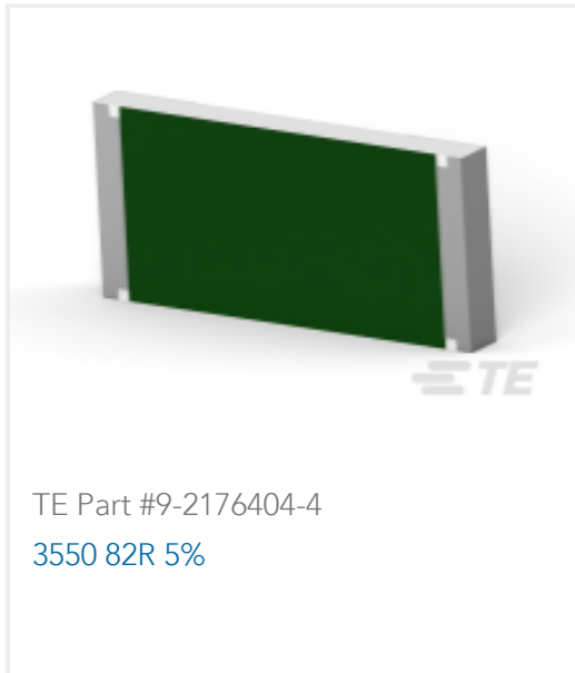
TE Part #9-2176404-4 3550 82R 5%