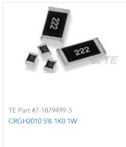
TE Part #7-1879499-3 CRGH2010 5% 1K0 1W