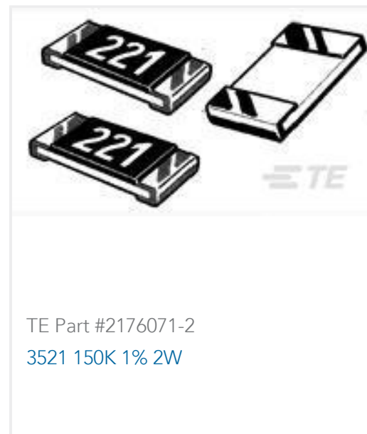
TE Part #2176071-2 3521 150K 1% 2W