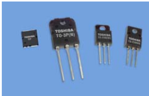
Download Larger Image (JPG 147KB)

"With a combination of low on-resistance, fast switching and ruggedness, our new DTMOS II devices are ideally suited for the switched-mode power supply and ballast lighting markets and are expected to enable a significant increase in power efficiency," said Jeff Lo, business development manager, Discrete Power Devices, for TAEC.