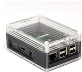
Height extension PIM060