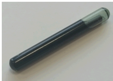
Figure 1-1. RI-TRP-DR2B Transponder

(2) The sizes shown here are approximations. For the package dimensions with tolerances, see the Mechanical Data in Section 5 .