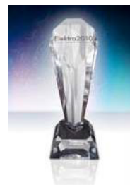
Elektra Award 2010