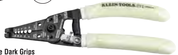
Glow in the Dark Grips