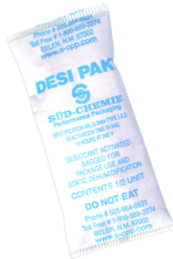
13840 & 13850

"...it is important to take possible temperature exposure into account when shipping electronic parts. It is particularly important to consider what happens to the interior of a package if the environment has high humidity. If the temperature varies across the dew point of the established interior environment of the package, condensation may occur. The interior of a package should either contain desiccant or the air should be evacuated from the package during the sealing process. The package itself should have a low WVTR." (ESD Handbook ESD TR20.20 section 5.4.3.2.2)