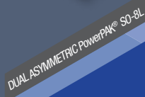
DUAL ASYMMETRIC PowerPAK® SO-8L

Optimized High and Low Side Combination for Synchronous Buck