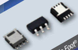
PowerPAK® Little Foot®

75 % Thinner and 55 % Smaller Than D 2 PAK