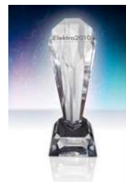
Elektra Award 2010