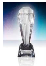
Elektra Award 2010