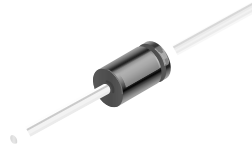
DO-35 Glass case